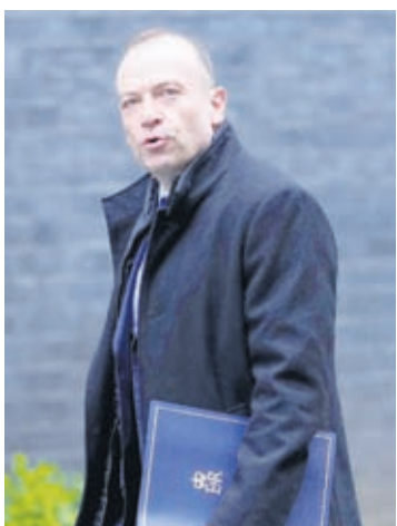
Secretary of State for Northern Ireland Chris Heaton-Harris arrives for a Cabinet meeting at 10 Downing Street in London, Tuesday, March 28, 2023.